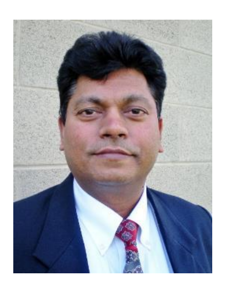
Helping organizations turn their project management capability into a competitive advantage